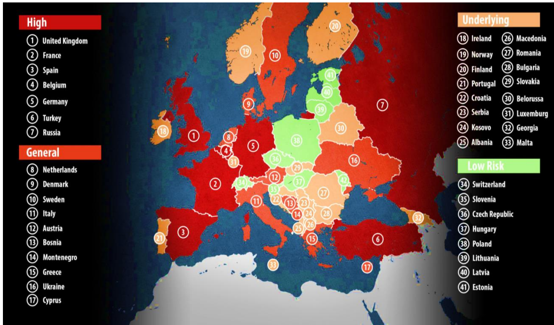
Figure A.1. Terrorism risk in Europe